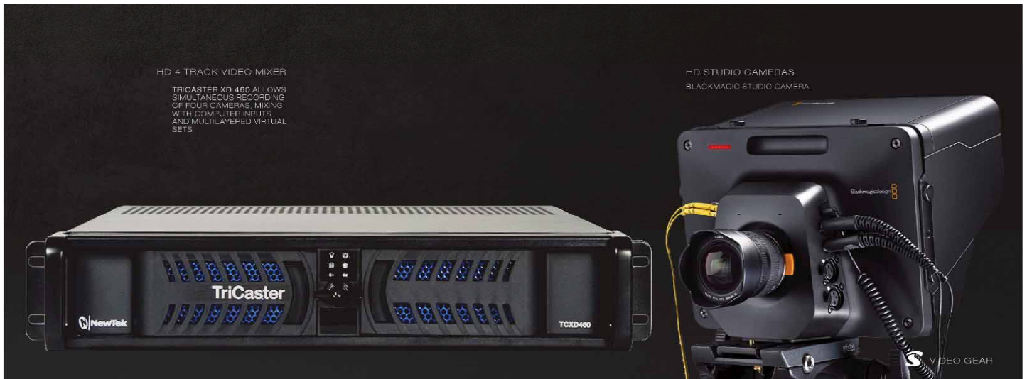
Tricaster XD460, 2x BlackMagic Studio HD Camera plus lenses.